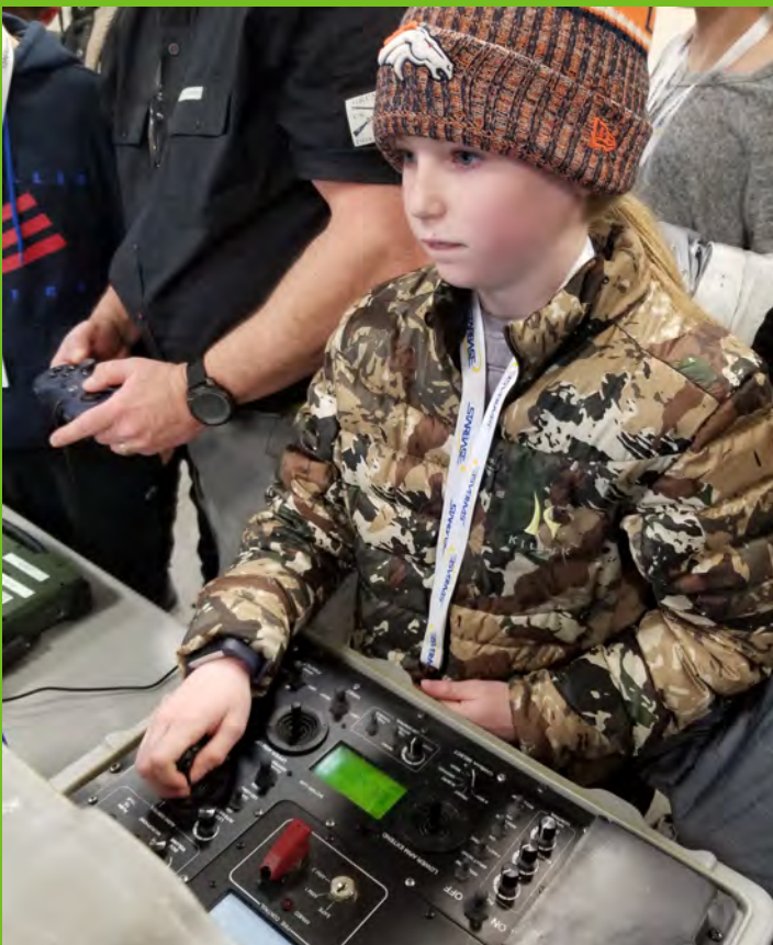
Rossiter student "Tomboy" attempts to pick up an object with a robotic arm while visiting the Advanced Technical Training Center on Fort Harrison.