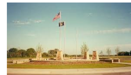
Eastern Montana State Veterans Cemetery Miles City, MT (406) 951-1325 MVADCemeteries@mt.gov