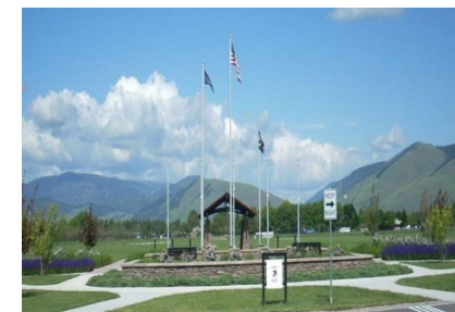
Western Montana State Veterans Cemetery Missoula, MT (406) 721-2995 MVADCemeteries@mt.gov