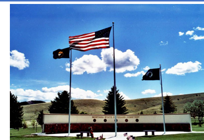
Montana State Veterans Cemetery Fort Harrison, MT (406) 324-3742 MVADCemeteries@mt.gov