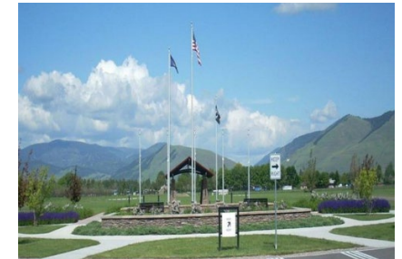
Western Montana State Veterans Cemetery Missoula, MT (406) 721-2995 MVADCemeteries@mt.gov