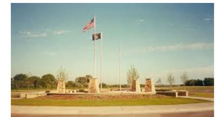
Eastern Montana State Veterans Cemetery Miles City, MT (406) 218-2945 MVADCemeteries@mt.gov