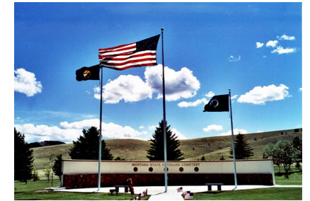
Montana State Veterans Cemetery Fort Harrison, MT (406) 324-4793 MVADCemeteries@mt.gov